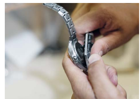
Cleaning in watch manufacture (e.g. bottom cases, watch straps, etc.)