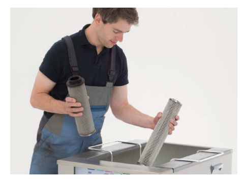
Industrial parts cleaning in workshops, production and servicing as well as for overhaul cleaning