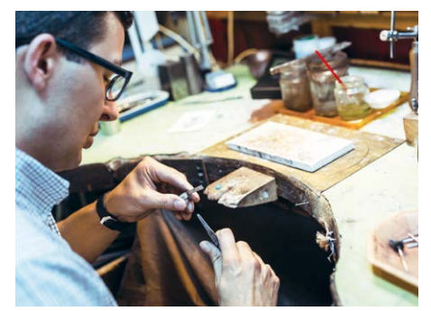
Cleaning in the jewellery industry (e.g. necklaces, earrings, bracelets, rings, etc.)

Elmasonic xtra ST devices are rated for continuous operation under the highest operational demands. The tanks are made of special stainless steel, which makes them robust with a long service life. In single-shift operation, they are guaranteed a warranty period of three years.