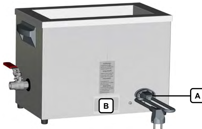
Illustration 4.6: Unit back view