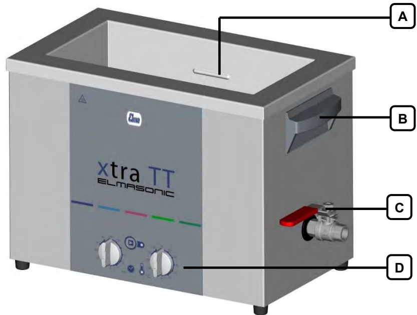
Illustration 4.5: Front view / side view Elmasonic xtra TT 60 H