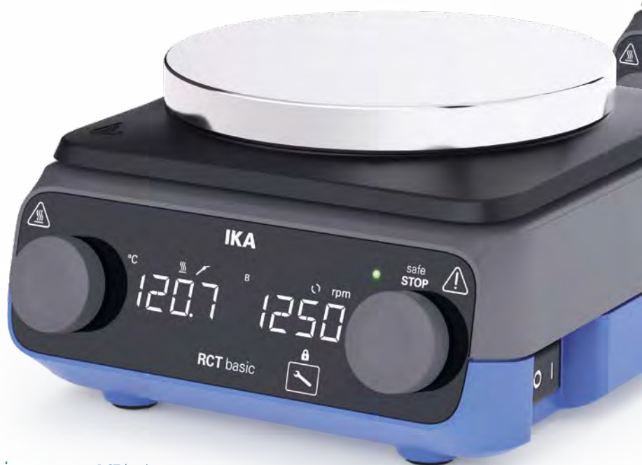
RCT basic Ident. No. 0025008259