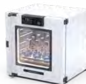
HEATING / COOLING / TEMPERING