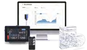
DIGITAL LAB SERVICES