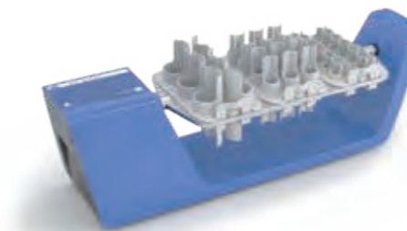
Trayster basic Ident-No.: 0004005000