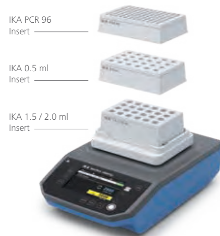
MATRIX Orbital Ident-No.: 0030000627

Our goal is to always offer you not only the highest quality devices, but also perfect laboratory solutions. And whoever uses pipettes for dispensing also needs ...