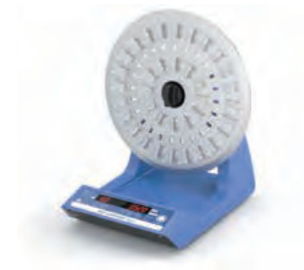
Loopster digital Ident-No.: 0004016000