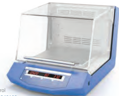
KS 3000 ic control Ident-No.: 0003940100