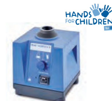
VORTEX 3 Ident-No.: 0003340000