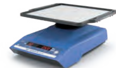
ROCKER 3D digital Ident-No.: 0004001000