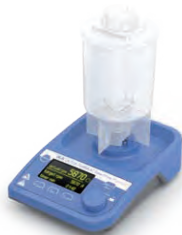
ULTRA-TURRAX® Tube Drive Power control Ident-No.: 0025005981