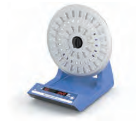
Loopster digital Ident-No.: 0004016000