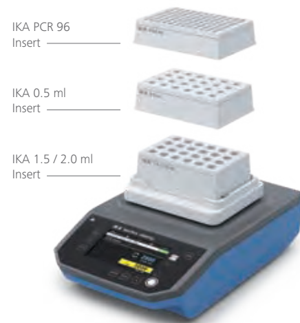
MATRIX Orbital Ident-No.: 0030000627

Our goal is to always offer you not only the highest quality devices, but also perfect laboratory solutions. And whoever uses pipettes for dispensing also needs ...