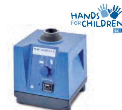
VORTEX 3 Ident-No.: 0003340000