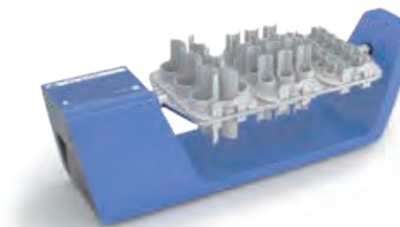
Trayster basic Ident-No.: 0004005000