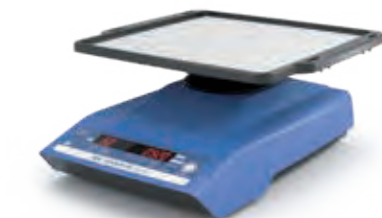
ROCKER 3D digital Ident-No.: 0004001000