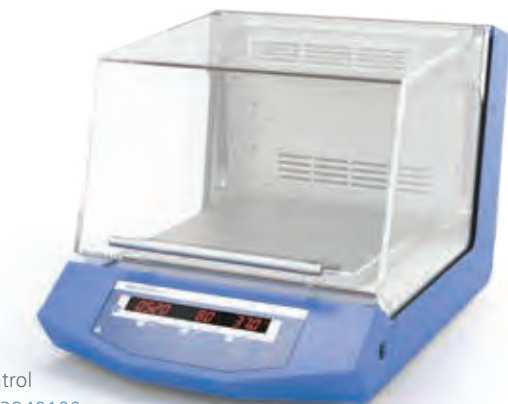
KS 3000 ic control Ident-No.: 0003940100