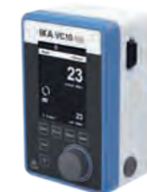
VC 10 pro Ident. No. 0020112031

Compatible only with VACSTAR digital, cable connection with vacuum pump is required.