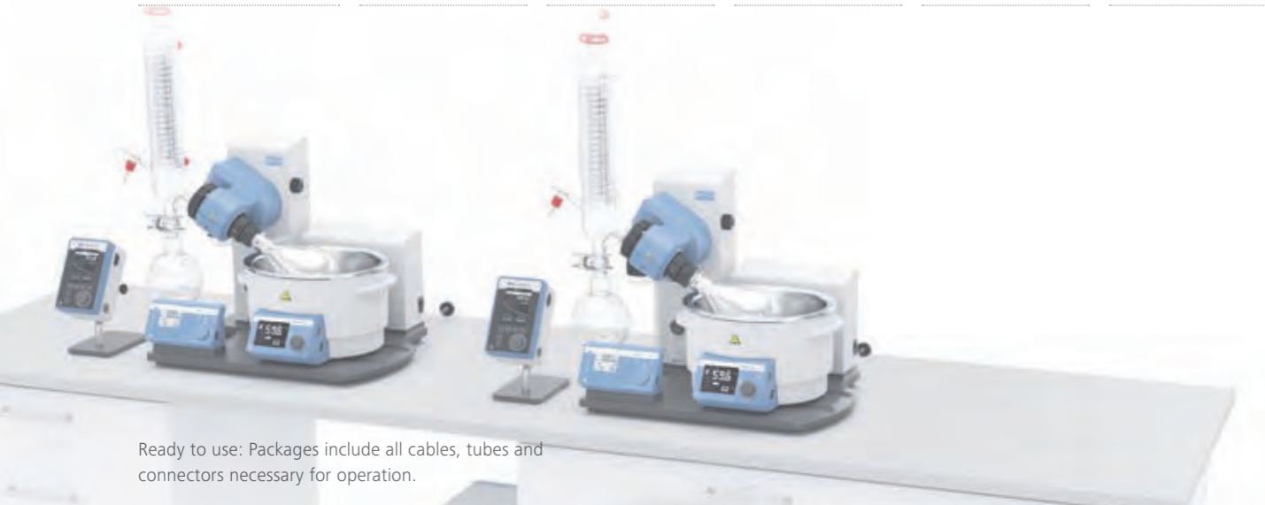
Ready to use: Packages include all cables, tubes and connectors necessary for operation.