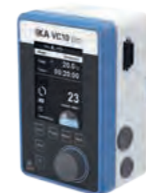
VC 10 lite Ident. No. 0020111998