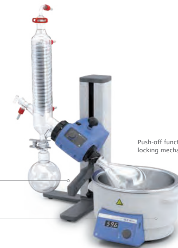
Push-off function and locking mechanism