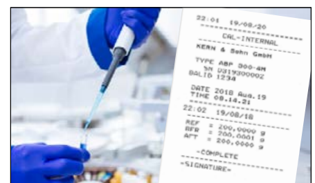
GLP/ISO record keeping, professional, detailed GLP Protocol, so that the balance is completely compliant with the relevant standard requirements in accordance with ISO, GLP and GMP