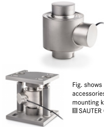
Fig. shows optional accessories, mounting kit ■ SAUTER CE P4136