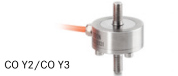
CO Y2/CO Y3