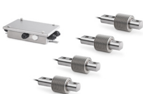
Illustration: series CW RB without display device