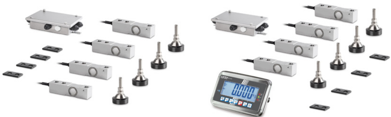
Illustration: series CW R without display device