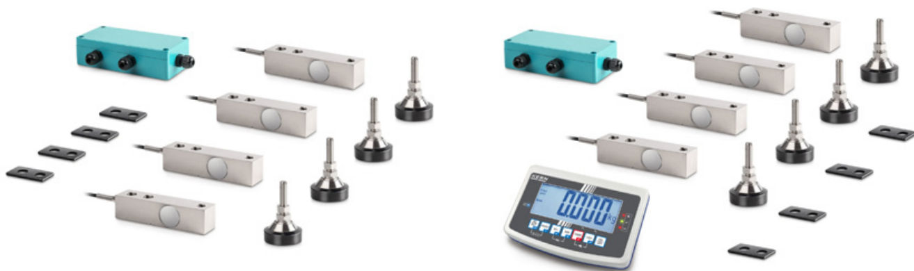
Illustration: series CW without display device