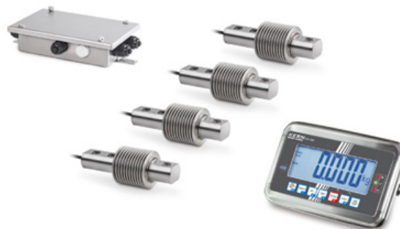
Illustration: series CW KFNB with display device