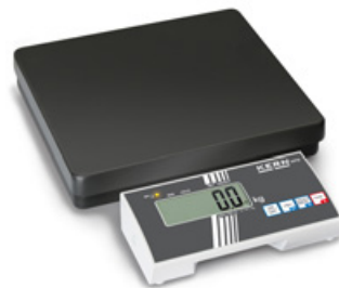
KERN MPB with free-standing display device