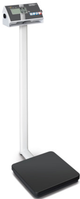
KERN MPB-P with stand