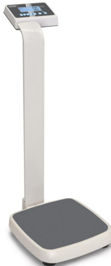
KERN MPE-P with stand