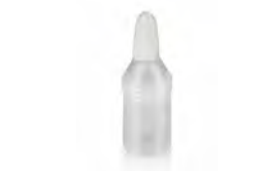
Calibration liquid/Contact liquid