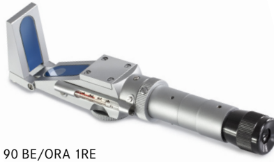
ORA 90 BE/ORA 1RE