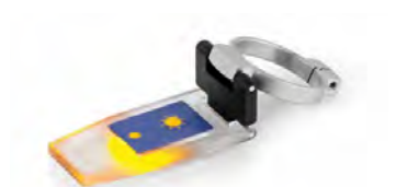
Prism coverplate with LED ORA-A1101