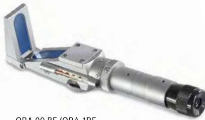
ORA 90 BE/ORA 1RE