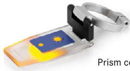
Prism coverplate with LED ORA-A1101