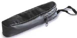
Leather bag ORA-A2103