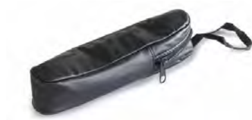
Leather bag ORA-A2103