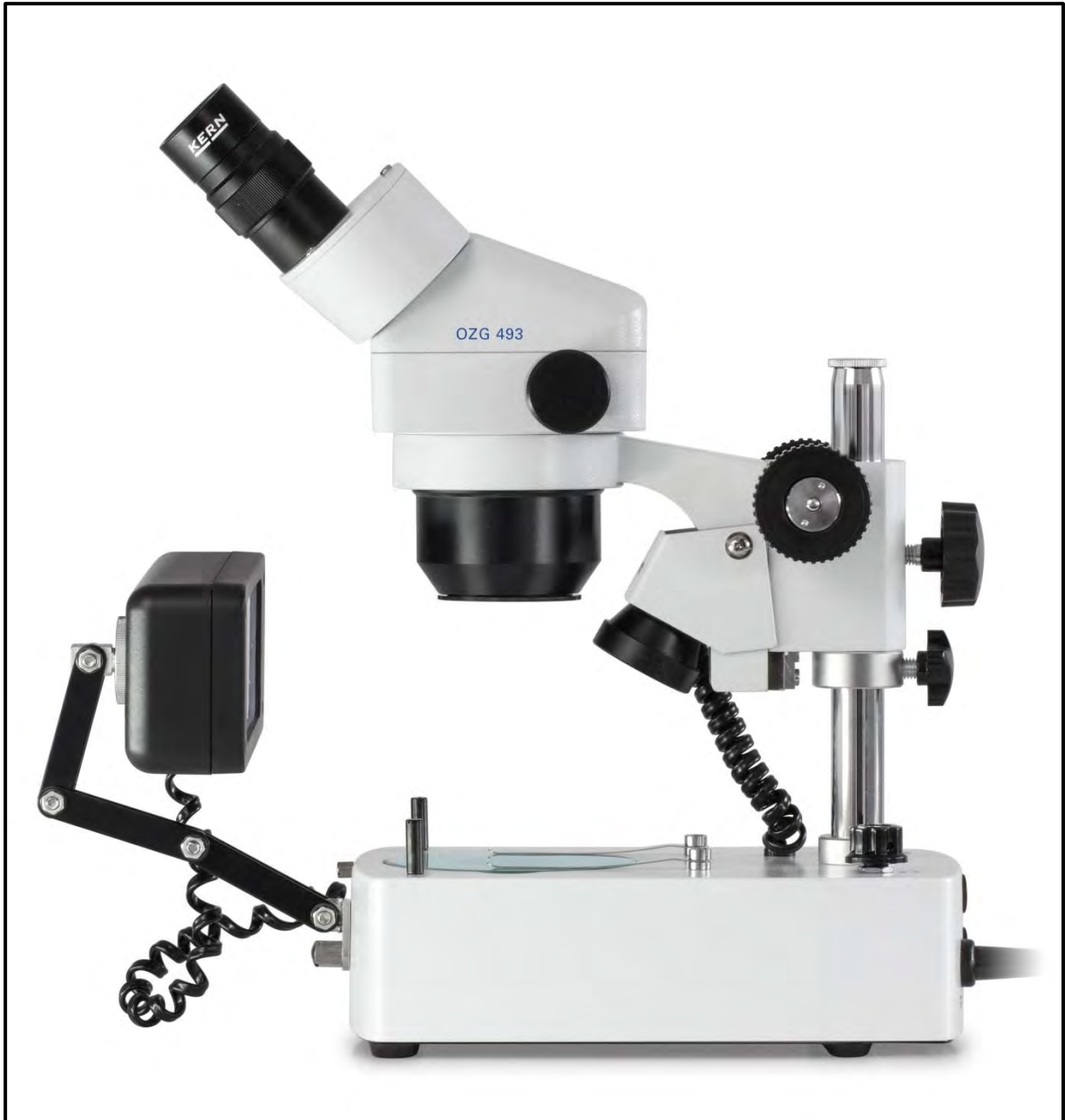
Assembled jewellery microscope (stereo zoom)