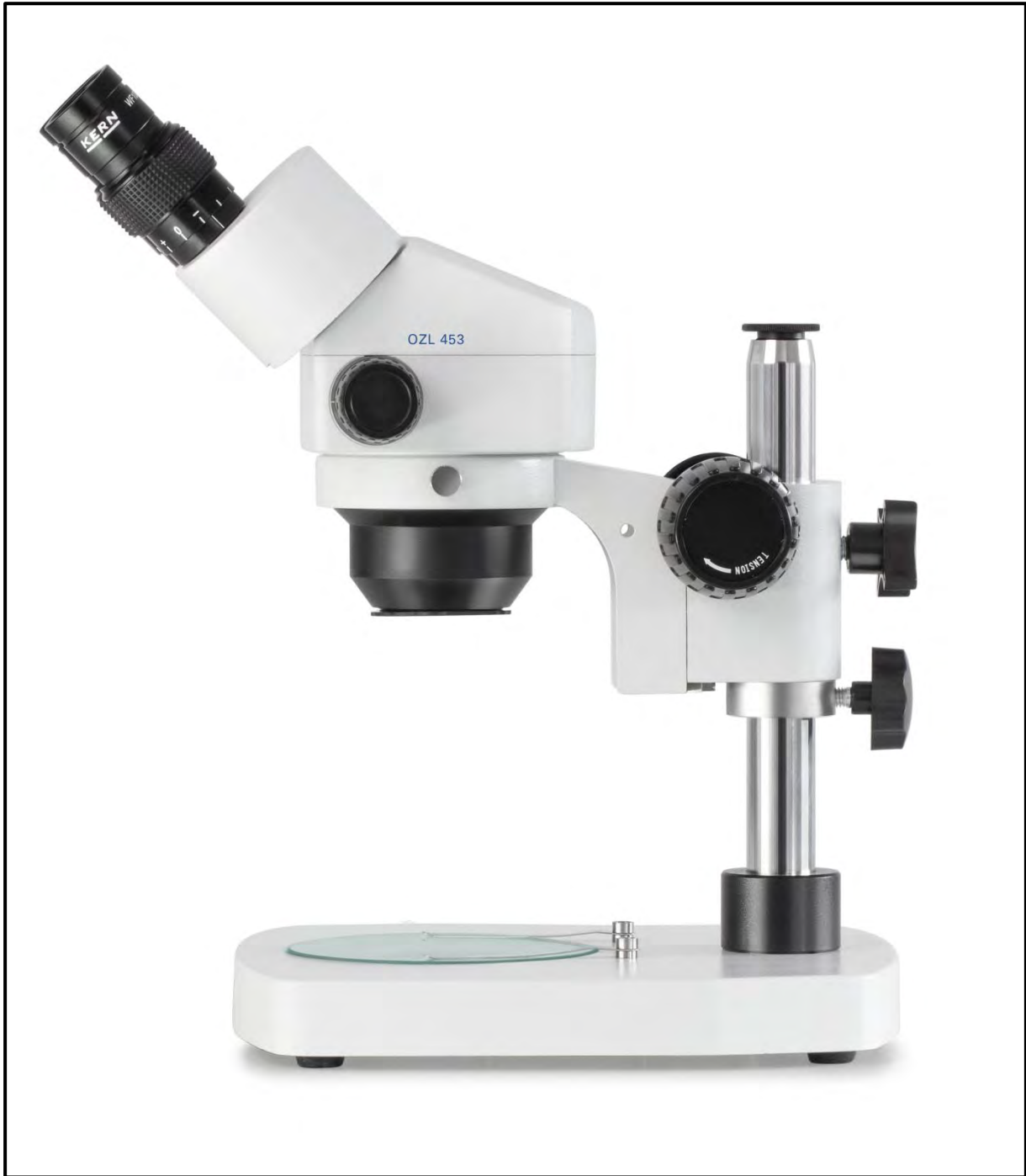
Assembled stereo zoom microscope (OZL 453)