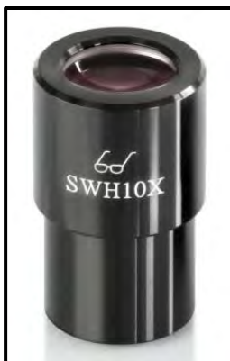
High Eye Point eyepiece (identified by the glasses symbol)