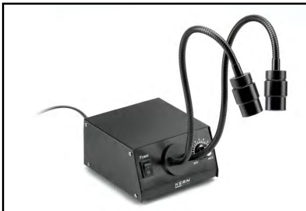
Typical goose neck lighting unit

The lighting units which are suitable for devices of the OZL-46 series, are goose neck lighting units ( see figure ). These are available as LED as well as halogen versions and also have an on/off switch or different controller.