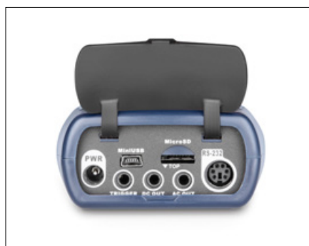
... and data transfer using MicroSD (4G) memory card (included in delivery), RS-232 or USB