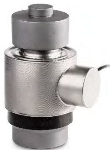
Illustration with measuring cell CD P1 (not included)