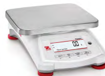
PX12001 and PX12001/E model