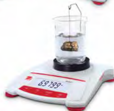
Scout shown with optional Density Determination Kit

It's all about accuracy and efficiency with the OHAUS Scout balance. Stabilization time as fast as 1 second combined with high resolution deliver extremely precise and repeatable weighing results that you can count on time and time again. This makes the Scout ideal for routine experiments and other weighing applications in your classroom.