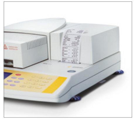
With optional printer YDP01MA