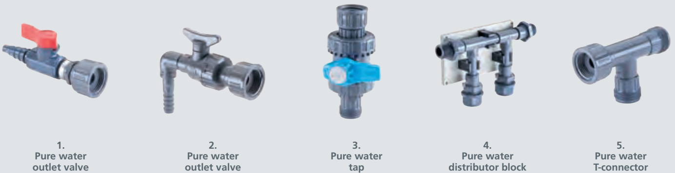
1. Pure water outlet valve