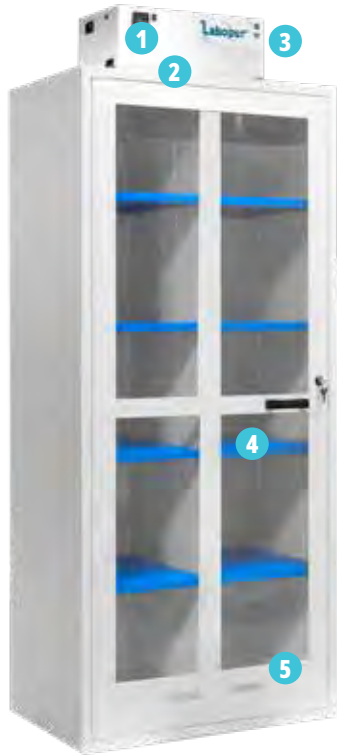
▲ AFP22 + CORGFC