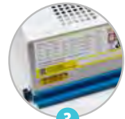
3 Standardized pictograms