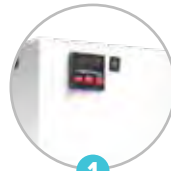
1 Counter hour meter