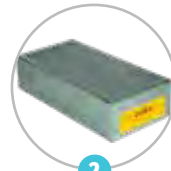
2 Active charcoal filter