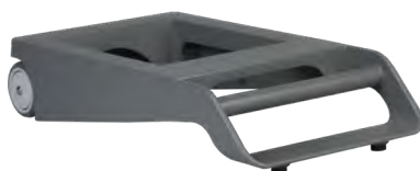
VACUU·PURE shuttle (20751800)