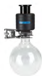
Inlet separator (AK) (20751802)