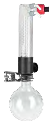
Exhaust vapor condenser (EK) (20751801)